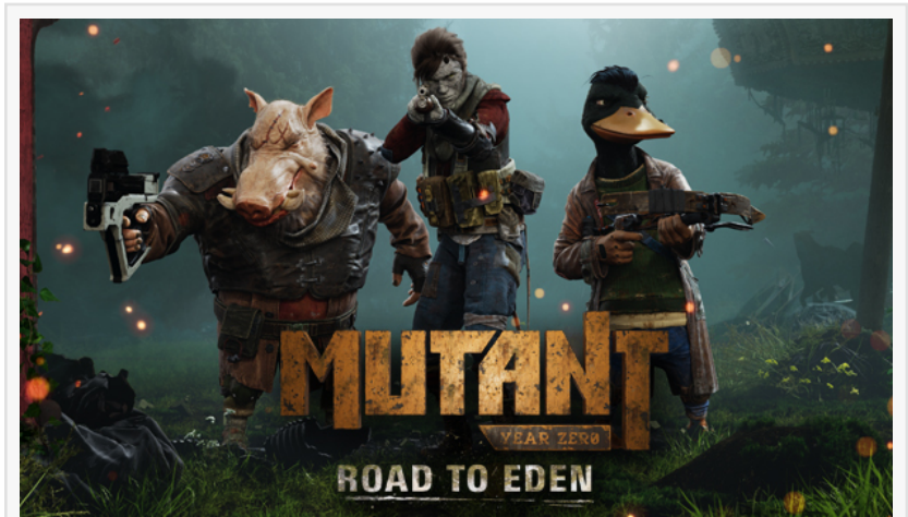
Mutant Year Zero: Road to Eden

ABOUT FUNCOM -- Funcom is an independent developer and publisher of online games for PC and consoles. Funcom has provided outstanding entertainment since 1993 and continues to expand its track-record of more than twenty released games. Titles include Conan Exiles, Secret World Legends, Age of Conan: Hyborian Adventures, The Longest Journey, Anarchy Online, The Park, and Dreamfall: The Longest Journey. For corporate information please visit www.funcom.com . For information about Funcom games visit www.conanexiles.com , www.secretworldlegends.com , www.anarchy-online.com , www.dreamfall.com , www.theparkgame.com , www.ageofconan.com . Funcom is listed on the Oslo Stock Exchange under the ticker FUNCOM.