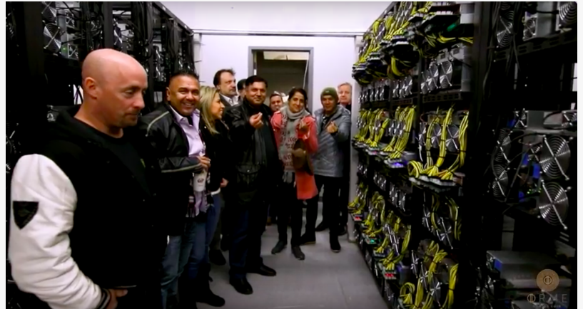
Hash Power: Mining tour guests taking in the crypto experience in North America

The exclusive video features visitors from all over the world grabbing an inside look at stationary crypto rigs and the latest mobile mining machines in action.