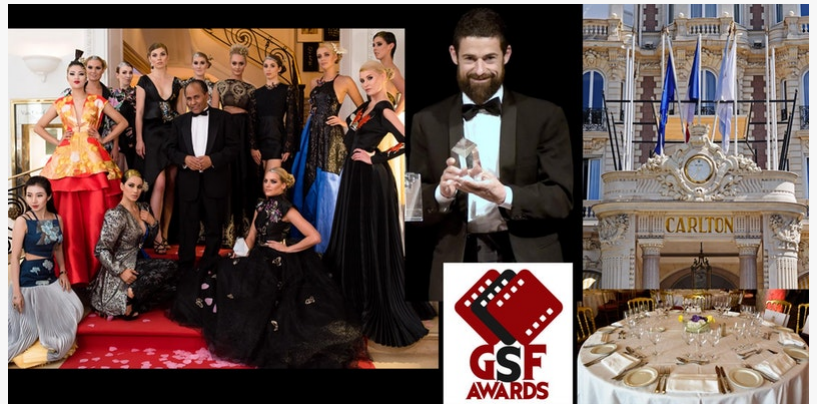
Global Short Film Awards Gala Cannes