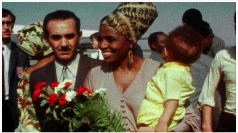
Mama Africa: Miriam Makeba