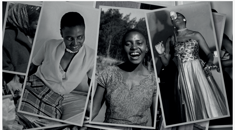
Young Miriam Makeba

This press release can be viewed online at: http://www.einpresswire.com