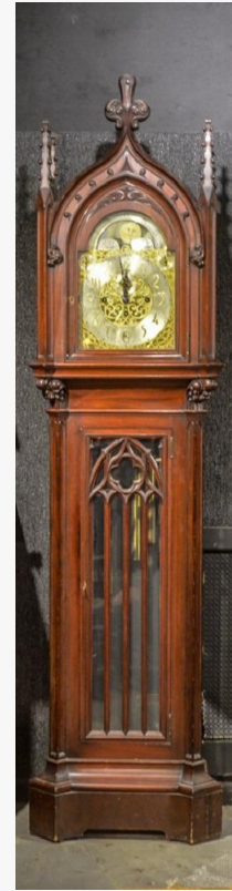
American 20th century Gothic Revival mahogany tall case clock, 8 feet 5 inches tall (est. $3,000-$5,000).