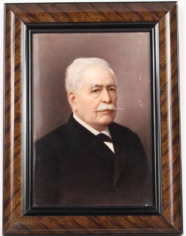
KPM porcelain plaque depicting General Hindenburg of aerial disaster fame (est. $3,000-$5,000)