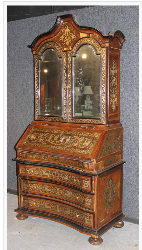
Late 17th/early 18th century Baroque inlaid walnut desk and bookcase, probably northern Italian (est. $8,000-$12,000).

Noteworthy lots up for bid from the Hathaway collection include a partly ebonized pair of 19th century English Regency brass-bound campaign chests, 39 ½ inches tall by 43 ½ inches wide (est. $4,000-$6,000); and a pair of cast-bronze angel wings made in Argentina in the 19th or 20th century (and