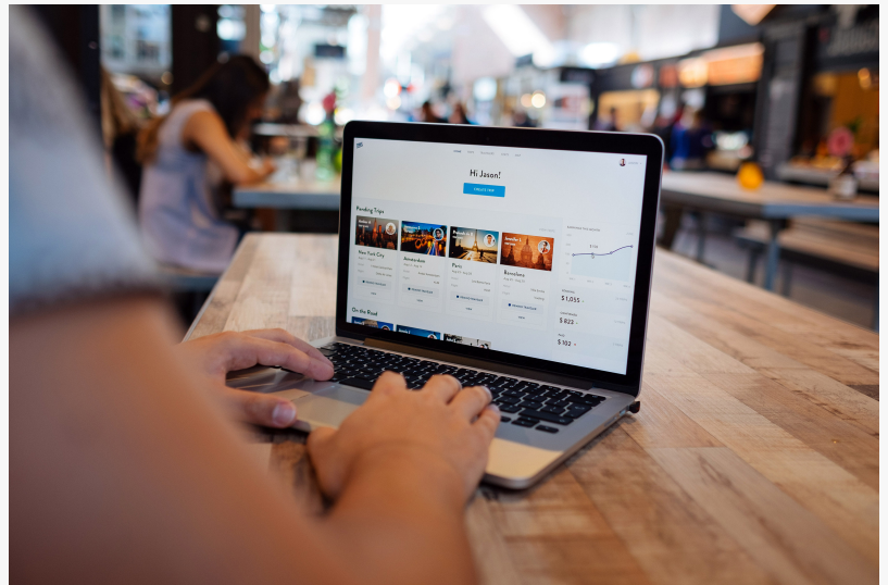
Traveler dashboard showing earnings