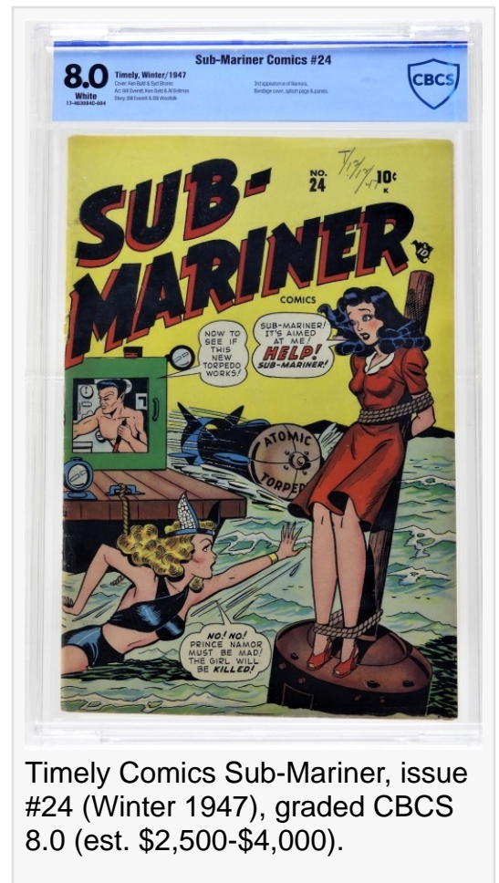
Timely Comics Sub-Mariner, issue #24 (Winter 1947), graded CBCS 8.0 (est. $2,500-$4,000).

This press release can be viewed online at: http://www.einpresswire.com