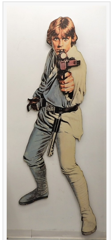
1977 Star Wars Luke Skywalker theater display, very rare, 8 feet 3 inches tall (est. $2,500-$3,500).

The page 16 artwork was executed around 1969 and carries a pre-sale estimate of $8,000-$12,000. It introduced the Grand Master character to the Marvel universe, later portrayed in an ironically hysterical way by Jeff Goldblum in the movie Thor: Ragnarok. The page is one of four from a collection out of Rumford, R.I. It is a rare piece of Marvel history.