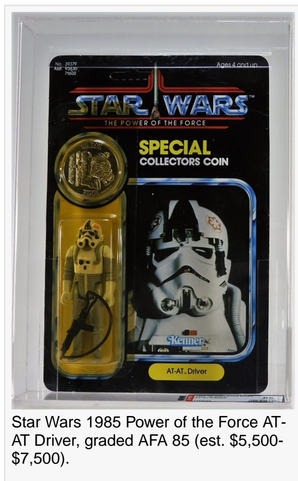
Star Wars 1985 Power of the Force AT-AT Driver, graded AFA 85 (est. $5,500-$7,500).

The second portion of the catalog will offer an eclectic mix of vintage American toys , led by a CAS high-grade set of ten 1988 Teenage Mutant Ninja Turtles. The set will be sold in single lots and all are