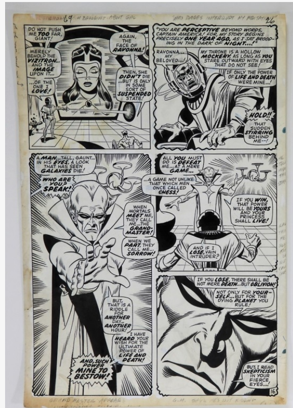
Original artwork for page 16 of Avengers #69, the first appearance of Grand Master (est. $8,000-$12,000).

Travis Landry Bruneau & Co. Auctioneers 4015339980 email us here