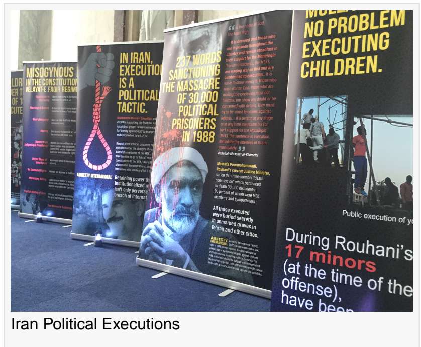
Iran Political Executions

This invitation is all the more regrettable in view of Tehran's malign activities in Syria, Yemen, Lebanon, Iraq, and beyond. We invite all human rights organizations, NGOs and concerned citizens to join us.