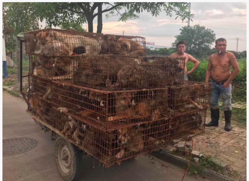
Dog Meat Trade