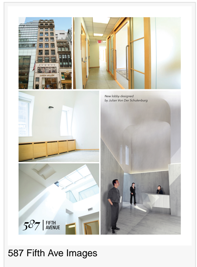
587 Fifth Ave Images