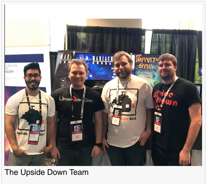
The Upside Down Team

ECGC partnered with Casual Connect to provide an Indie Prize scholarship and competition focused on the up and coming creative force of the games industry for Indie Alley start-ups. ECGC is proud to announce Super Gravity Ball ™ by Upside Down Bird is this year's winner. The team earned passes to Casual Connect in London May 29-31st, a spot at their Indie Prize showcase and a $1000 from ECGC.