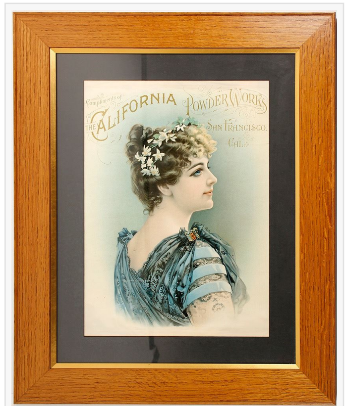
Oak-framed broadside poster for California Powder Works, circa 1885, 24" by 30" (est. $12,000-$18,000).

Other stars of the Native Americana category include the following: