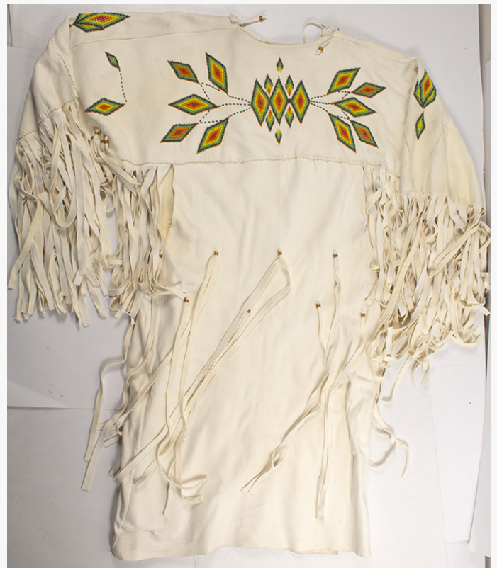
Native American Indian buckskin Pow Wow dress, colorfully beaded and fringed (est. $1,000-$3,000).