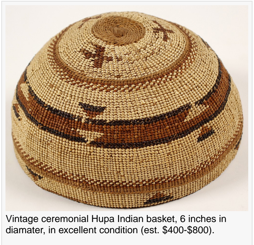
Vintage ceremonial Hupa Indian basket, 6 inches in diameter, in excellent condition (est. $400-$800).

The cowboy and Western portion of the day will feature a wide selection of bits