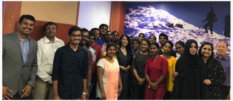
TASK Training Batch

DALLAS, TX, USA, April 26, 2018 /EINPresswire.com/ -- Telangana Academy for Skill and Knowledge, TASK , has been persistent in enhancing the knowledge and skills of students and consistently walks the extra mile by introducing industry relevant skill programs.