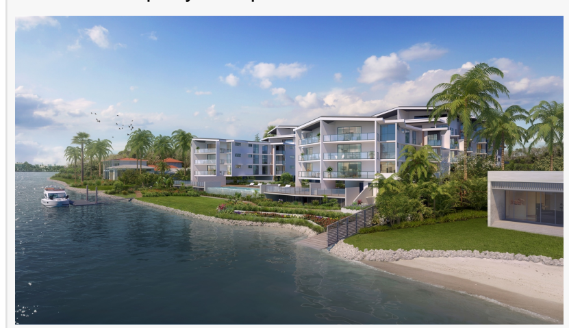
With main river views obtained from the most favourable north-facing aspect, Riverfront Residences on the Nerang River at Carrara has been designed to encapsulate the outstanding vistas across the water.

Botanic Gardens and expanding out to the city skyline.