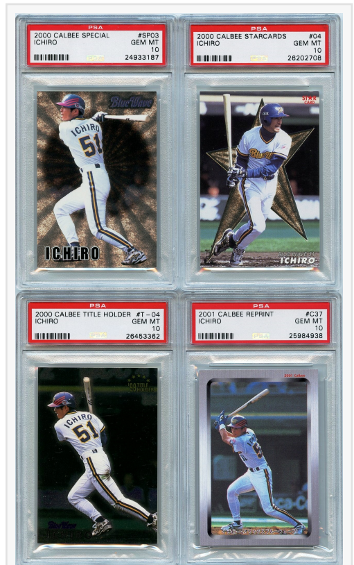
Master collection of 54 Japanese Calbee cards (4 shown), from Ichiro Suzuki's playing days in Japan (MB: $2,000).

This press release can be viewed online at: http://www.einpresswire.com