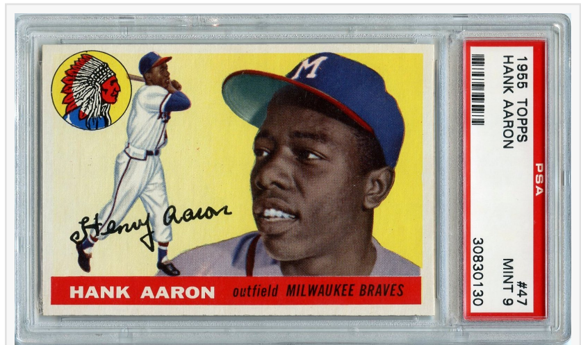
1955 Topps #47 Hank Aaron baseball card graded PSA Mint Pop 25, the finest example known (MB: $5,500).

Small Traditions charges a zero percent sellers' rate for this work, and there is no cost to its consignors for grading up to 500 cards at one time. The company pays for all grading fees up front,