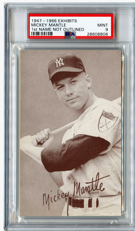
Mickey Mantle card, graded PSA 9 Mint Pop 2, distributed by Exhibit Supply Co., Chicago (MB: $1,000).