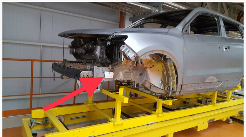
Access Control RFID UHF

This long-range solution is a game changer for those businesses that already use RFID technology. RFID (radio frequency identification) is used to automatically identify and track tags, or chips, attached to objects, products or people. The scanner picks up information from the tags or chips and the information about the object or person is transmitted to the access control software , which enables access to doors, gates, machinery and more.