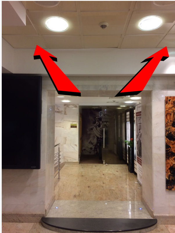
Access Control Invisible RFID UHF

“While RFID has many applications and has been the standard for access control, we knew our