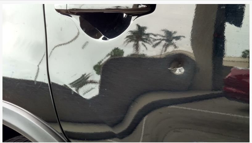
Pre-existing body damage noted with rental agent after thorough inspection, outside and inside (probable liability without notation)

Related: SubscriberWise founder and National Car Rental crime victim presents comprehensive presentation of attempted financial theft and fraud evidence at FL AG office in Tampa -- https://www.businesswire.com/news/home/20170303005471/en