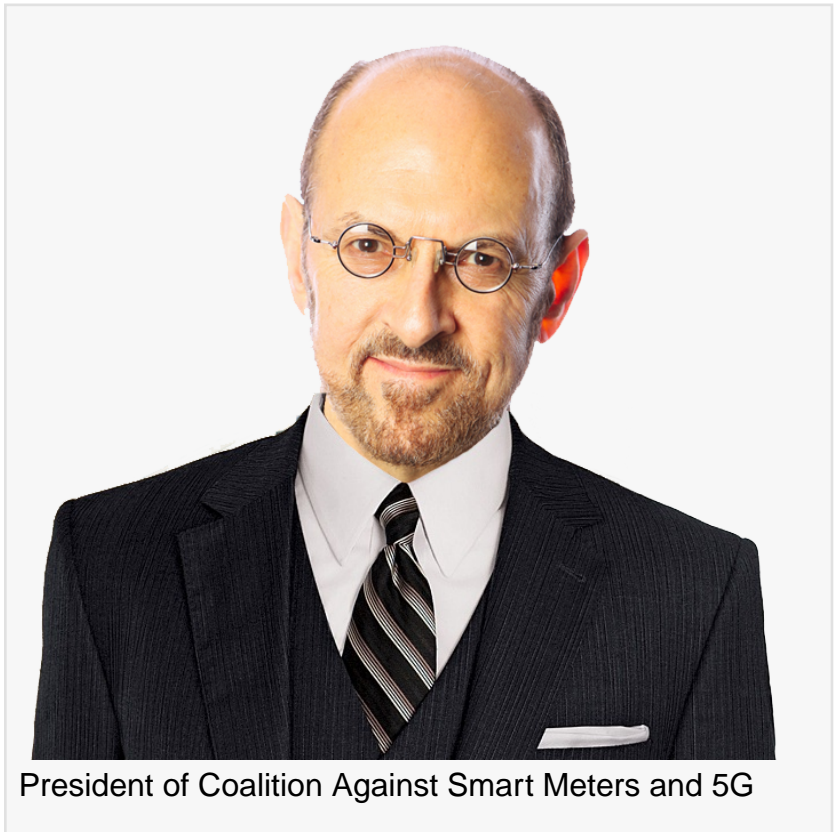
President of Coalition Against Smart Meters and 5G

May 4, 2018 – Seattle WA - The Coalition Against Smart Meters and 5G has sent a demand to Seattle that it quit installing smart meters, remove those installed, and ban 5G technology. The Coalition is also demanding that Seattle remove Wi-Fi from schools.