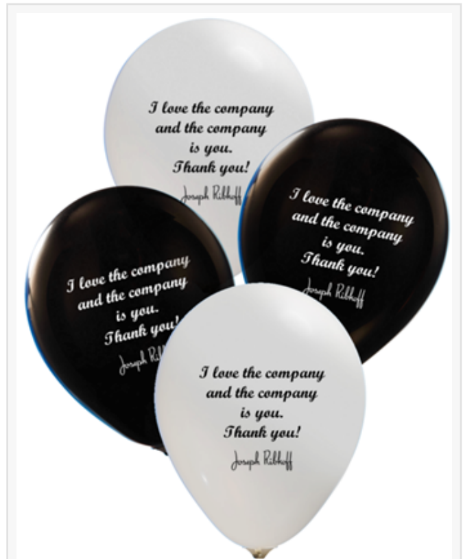
Some companies prefer offering clusters of personalized balloons.

For more than fifteen years, CSA Balloons has been a leader in custom balloon printing. With offices in Canada and the USA, they supply personalized balloons to clients throughout North-America. Their dedicated staff will help any business, association, or party planner create the perfect custom balloons for any event. Renowned for their impeccable print quality, fast delivery, and outstanding customer service, they are the top-choice balloon printers for