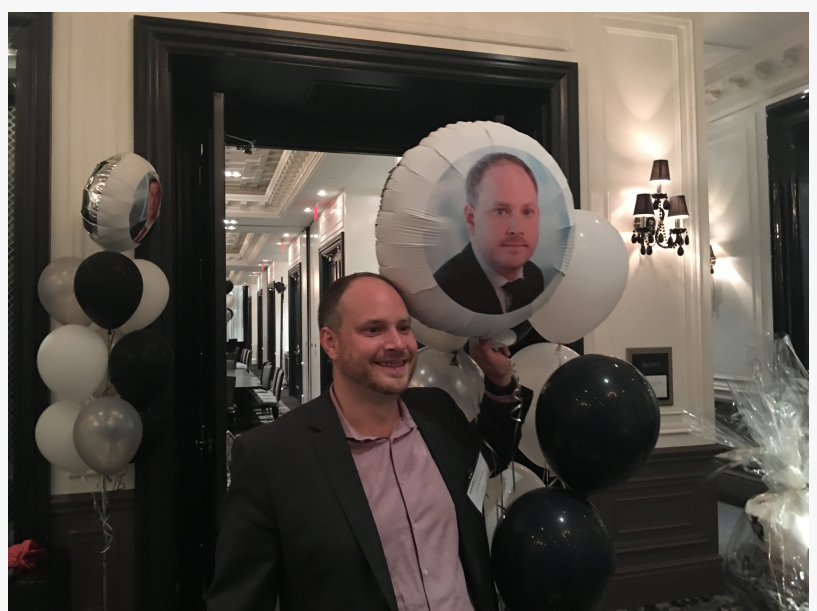
One of CSA's corporate clients offers custom photo balloons when an employee is promoted.

With Glassdoor recently ranking Facebook as the best place to work in 2018 , due to, among other perks, their famous “ Faceversaries ”, it’s no wonder that companies are looking for original ways to celebrate their staff’s efforts. Many studies have proven the benefits of employee recognition and the many reasons why employers should invest in recognizing their workers; the most obvious being that, when employees feel valued, their level of satisfaction rises and so does their productivity. Moreover, adopting employee recognition practices will help employers retain top talent, and, hence, increase business.