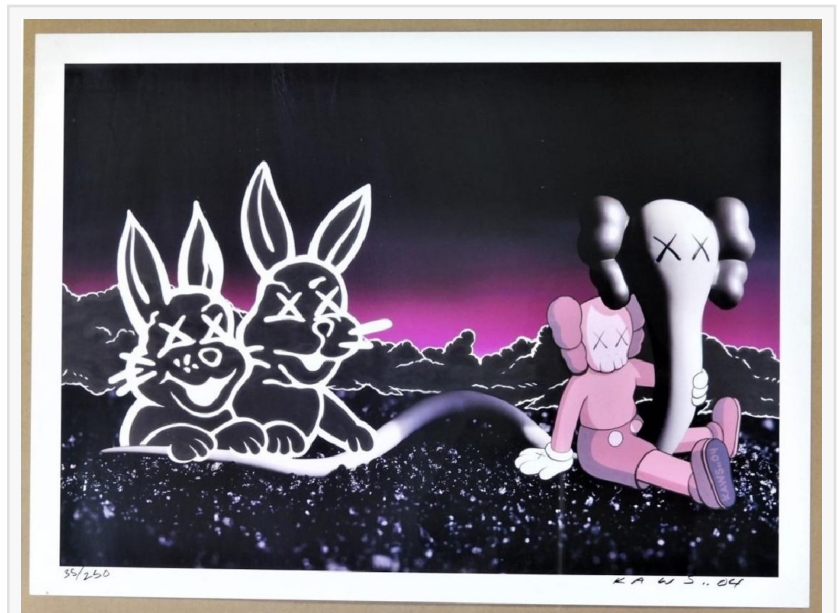
Offset lithograph in colors by KAWS (Am., b. 1974), titled Undeatead Billboard (2004).