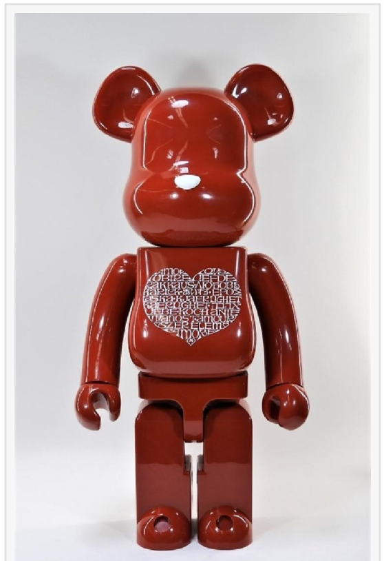
Painted cast vinyl figure by Alexander Girard (N.Y., 1907-1993), in collaboration with X BE@RBRICK, titled International Love Heart (2009).