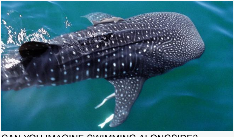
CAN YOU IMAGINE SWIMMING ALONGSIDE?

Cold water & Soft drinks on board + afternoon Fresh Ceviche at North Beach on Isla Mujeres.