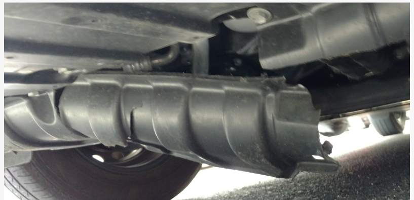
Under car damage could result in driving hazard and liability

CHICAGO, ILLINOIS, UNITED STATES OF AMERICA, May 7, 2018 /EINPresswire.com/ -- SubscriberWise , the nation's largest issuing CRA for the communications industry and the leading protector of children victimized by identity fraud, announced today the unfortunate -- and frightening -- confirmation to the question postulated in 2013 by the Chicago Tribune: " Will the Canadian Car Rental Scandal Spread to the U.S.? "