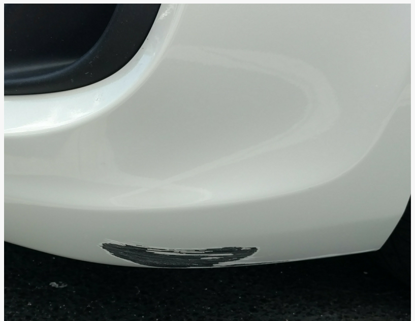
Significant scrape creates possible financial liability for renter