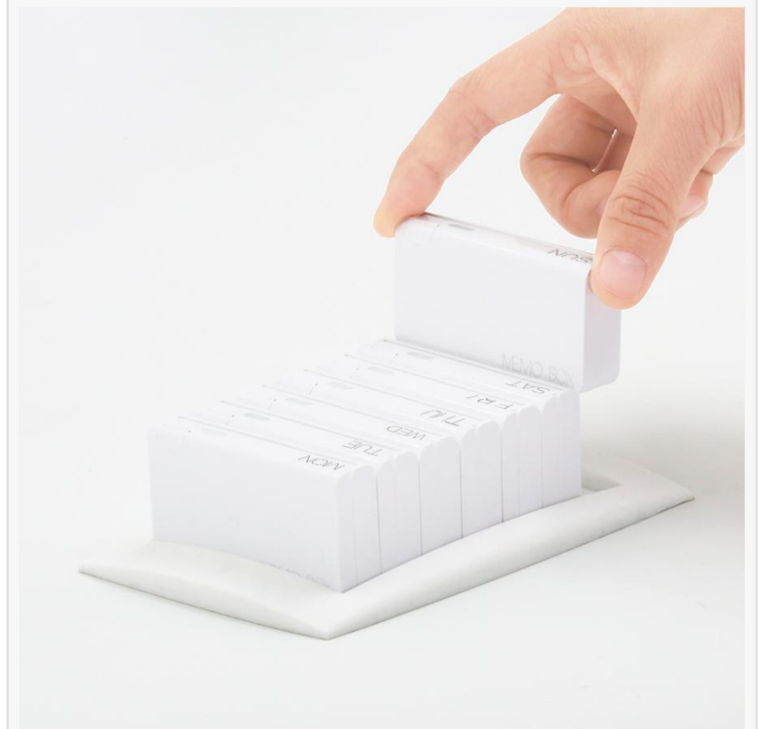
Memo Box 7-Day Smart Pillbox Set Dock