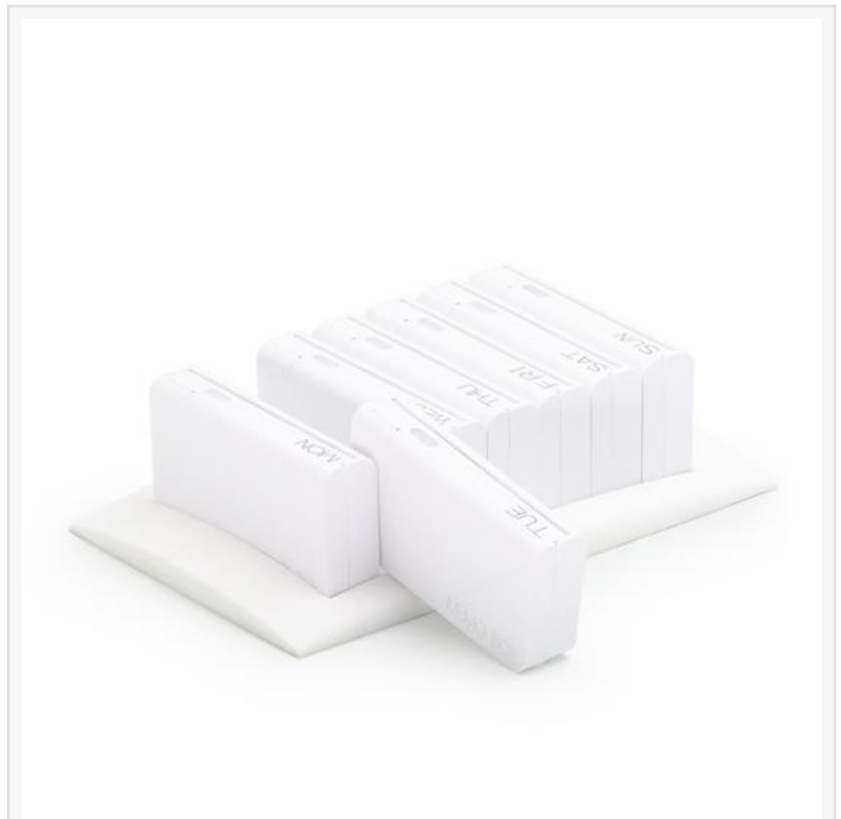
Memo Box 7-Day Smart Pillbox Set