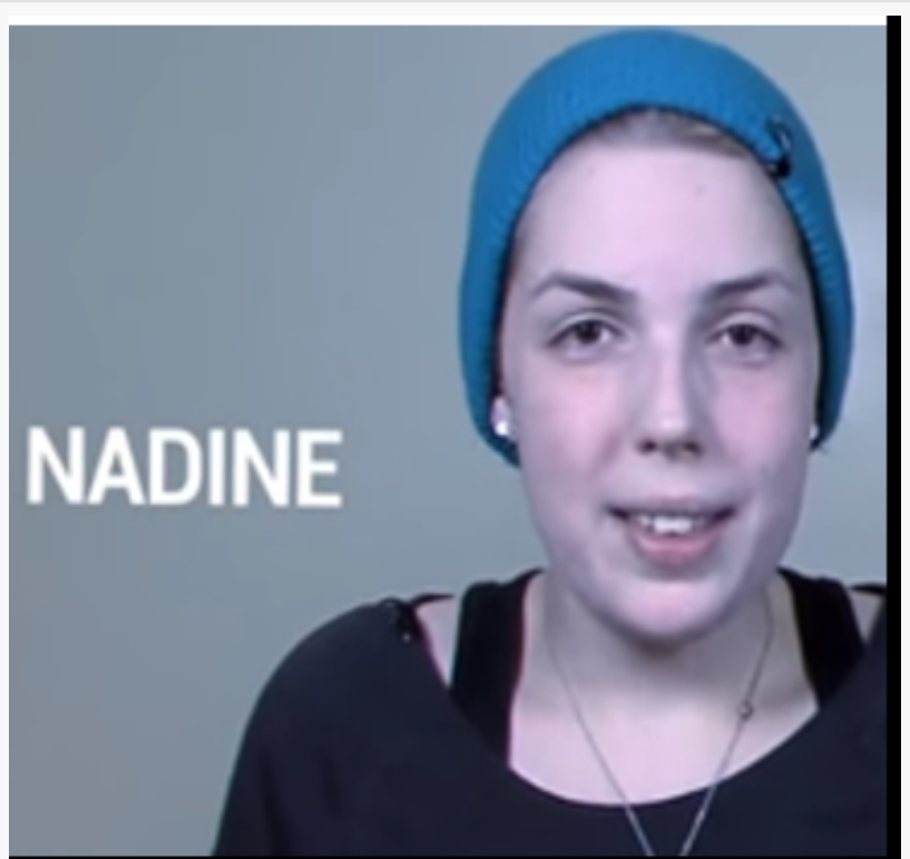
Happy to be alive