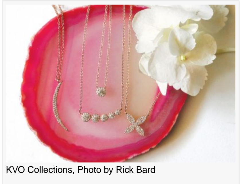
KVO Collections, Photo by Rick Bard

Here’s to the bold, the beautiful, the courageous women Who dare every day to make a difference. Different goes beyond what we wear and how we wear it. It’s about what we do and the way we do it. Every. Single. Day.