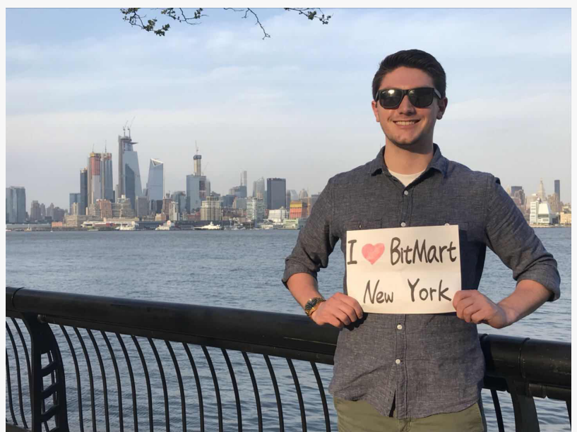
Bitmart Photo Contest Example 1

Instagram: https://www.instagram.com/bitmart_exchange