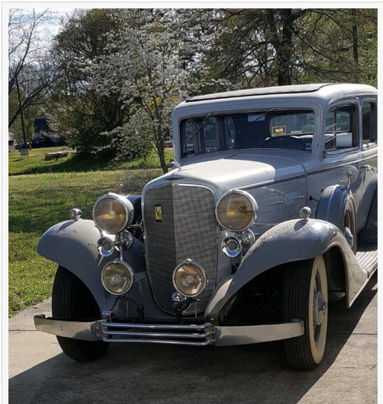
1933 V-8 Cadillac, gray in color and looking virtually brand new, having been restored ten years ago.

Another visually striking lot is the cast bronze garden fountain with lion heads and children, signed "Jim Davidson", impressive at 10 feet 7 inches tall. The fine art category is impressive as well and features two antique oil on canvas