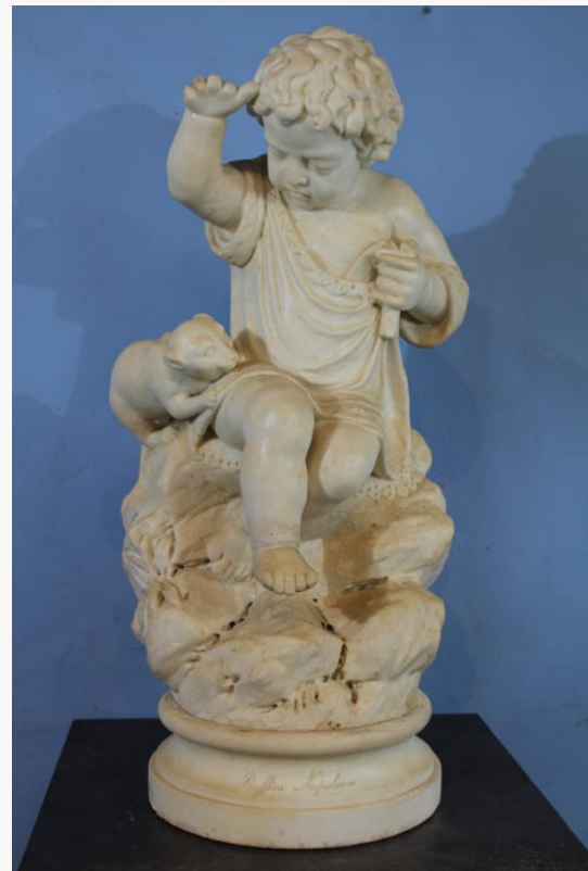
Two-part marble statue of a little girl with a cat, 31 inches tall, signed "Napoleone Ruffini".