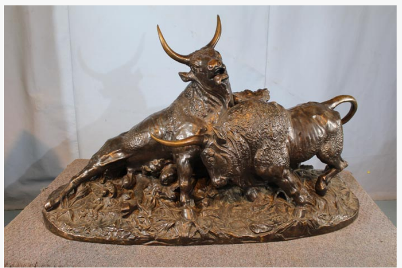
Bronze sculpture of two Spanish bulls fighting, signed by Jean Baptiste Clesinger (1814-1883).