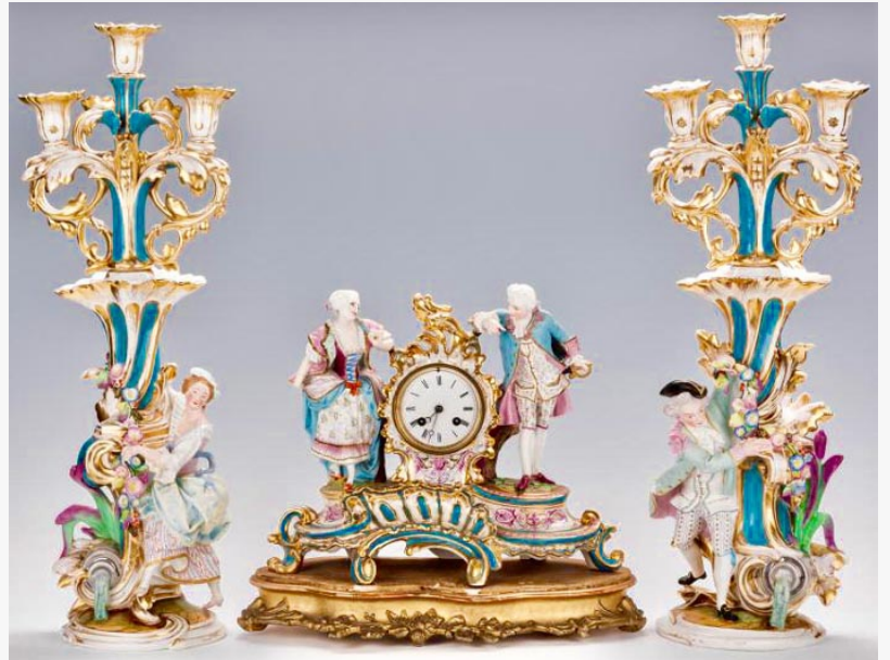
Magnificent three-piece marble clock set with bronze accents.