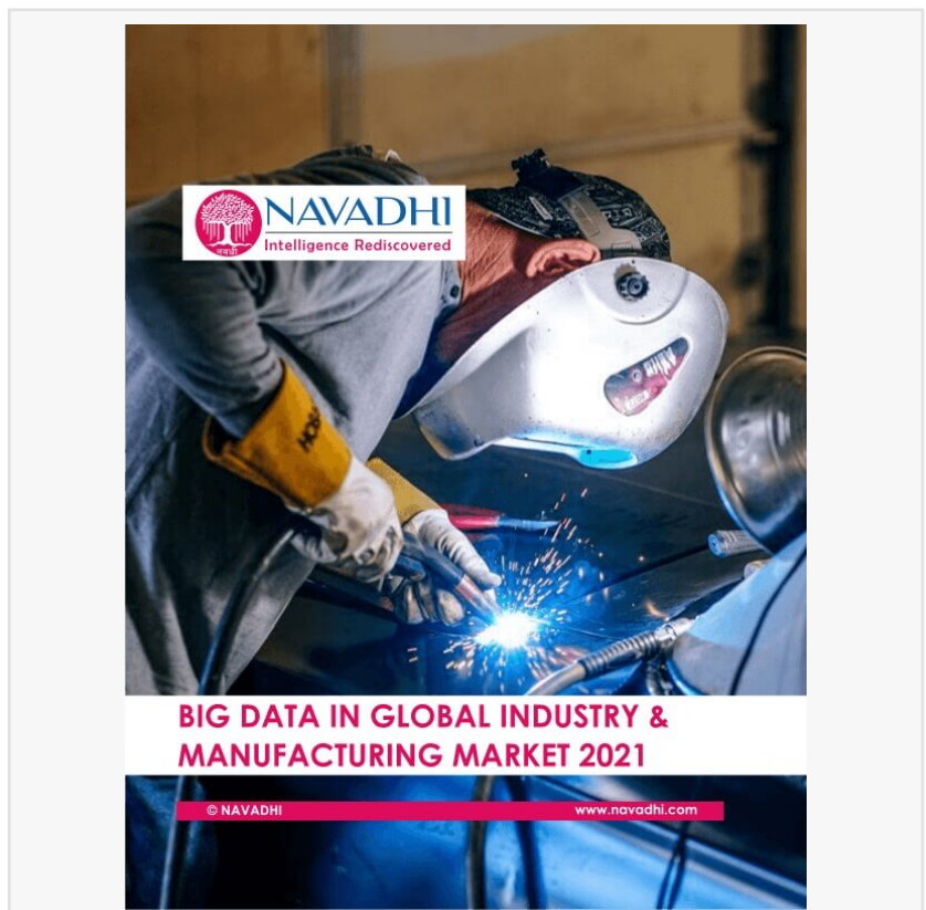
Big Data in Global Industry & Manufacturing Market 2021

Granular utilization data is one of the major aspects that a manufacturing industry can get by implementing Big Data Analytics. For example, when does your factory produce its greatest output? What days? What hours? And at what mix and with who on the floor? Again, the idea here is to study