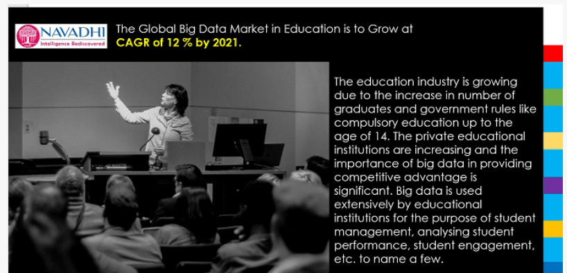
Big Data in Global Education Market