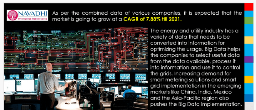
Big Data in Global Energy & Utility Market