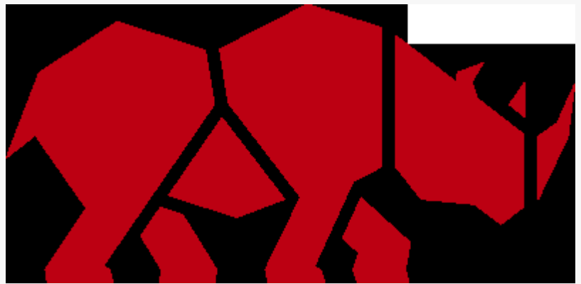
RhinoFit's Martial Arts Management Software

/EINPresswire.com/ -- RhinoFit, created in 2012 as an Affiliate gym management software solution but which has since grown to represent an industry-leading company and favorite software solutions provider for gyms, dojos, clubs and fitness studios alike, has announced the launch of its fully-featured martial arts management software . RhinoFit, in targeting dojo and martial arts studio owners, is now offering this customizable software system that is easy to set up, saves time via efficiently intuitive programs specific to customers' niche business and which integrates with RhinoFit's payment processing company or the customers'.