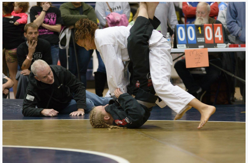
Combat and Dojo Management Software