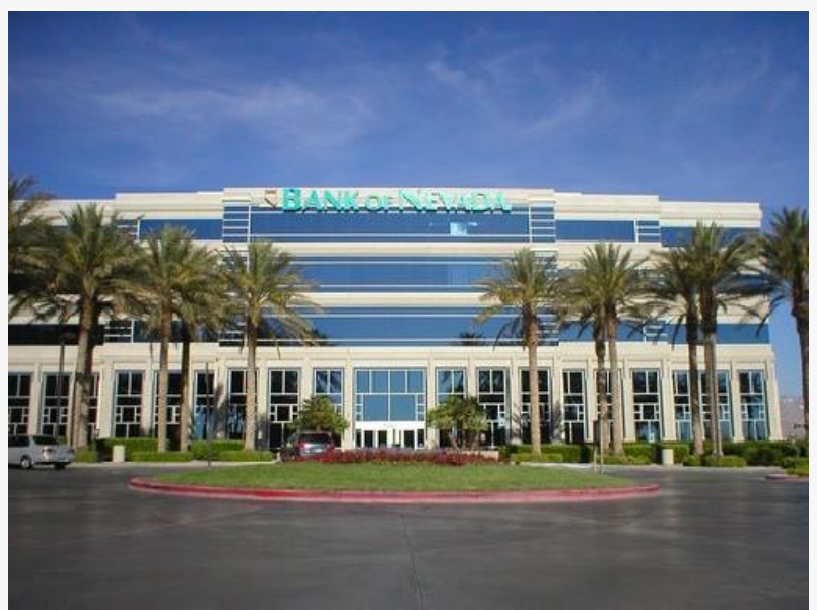
Cambridge Trading Academy Headquarters