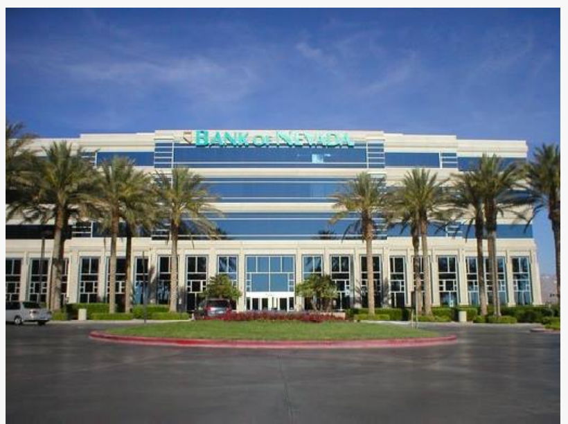
Cambridge Trading Academy Headquarters

The Cambridge Trading Academy New Automated Day Trading software is easy to understand because they turn it at night and turn it off in morning SET IT and FORGET IT !! Users just have to follow the six simple indicators and be patient, rather than "hunting" for stocks and trades to take. Once the software is purchased, the user can download it on any computer or mobile device or on multiple devices.