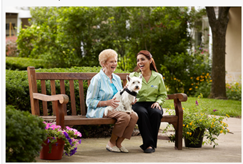
Comfort Keepers of Warren New Jersey Location

do a big house clean once or twice a year, but as time passes, their needs will increase.