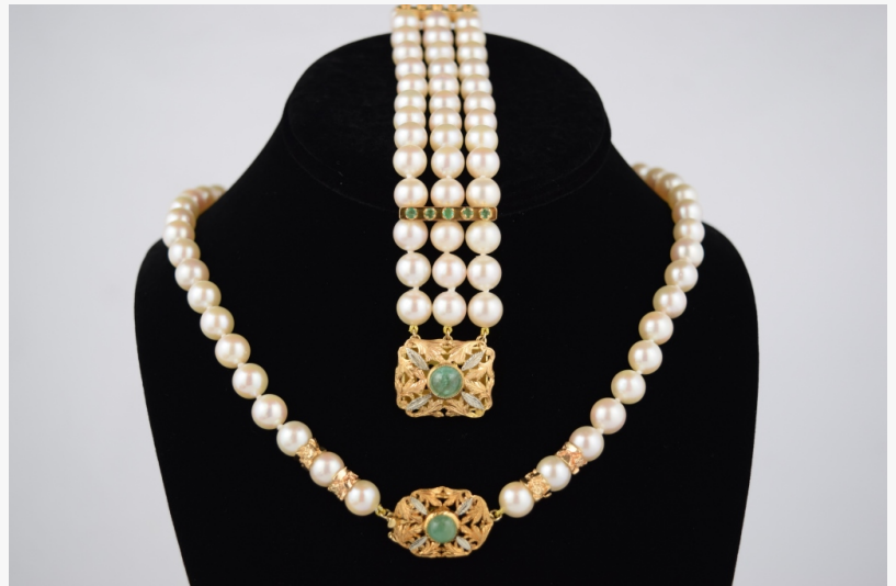
Stunning Mikimoto 18kt gold, emerald and pearl bracelet set, with pearls having excellent luster (est. $6,000-$8,000).