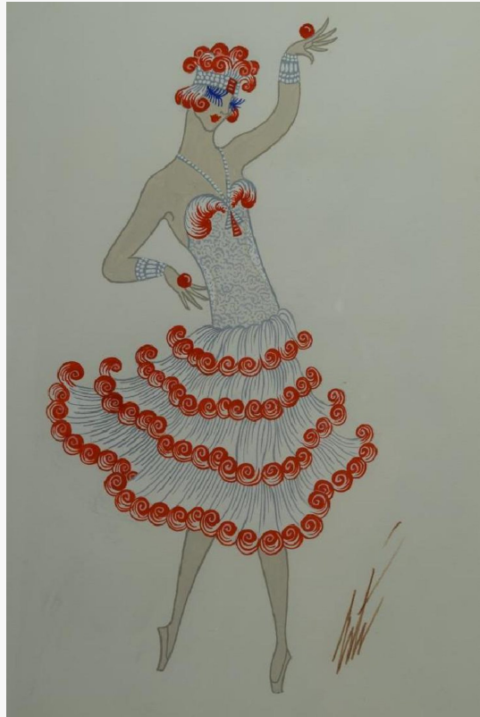
Original gouache painting by the French artist Erte (1892-1990), titled Parisian (est. $4,000-$6,000).