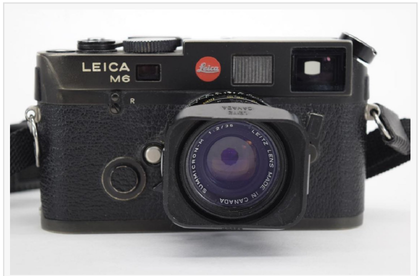
Leica M6 black camera with Summicron-M 1:2/35 lens, one of several Leicas in the sale (est. $2,000-$3,000).

Tarek ElJabaly Auction Life, Inc. (561) 757-1551 email us here