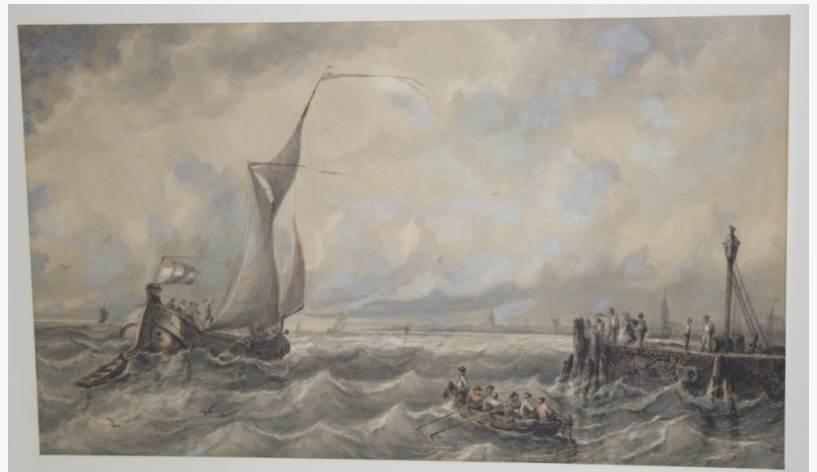
Circa 1840 watercolor seascape painting titled Entrance to Amsterdam Harbour, signed with an illegible monogram (est. $1,000-$10,000).