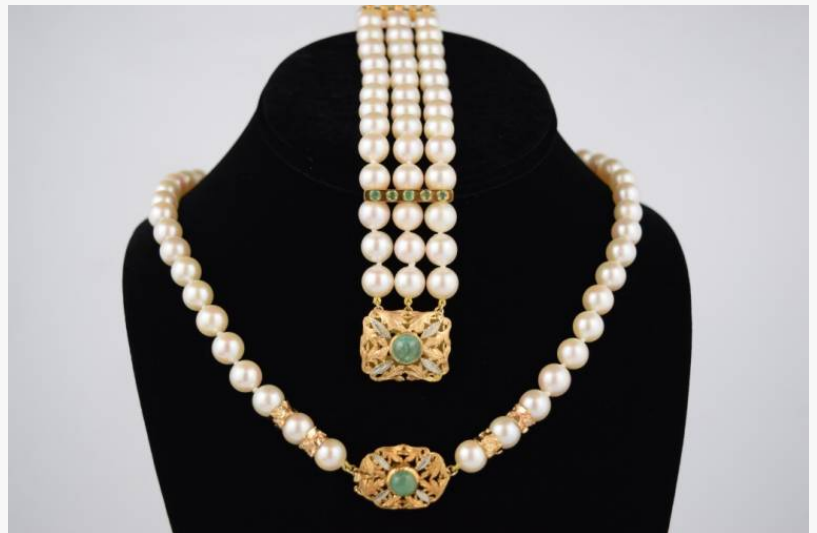
Stunning Mikimoto 18kt gold, emerald and pearl bracelet set, with pearls having excellent luster (est. $6,000-$8,000).