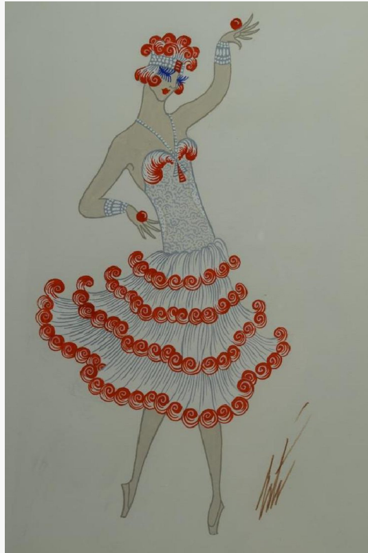
Original gouache painting by the French artist Erté (1892-1990), titled Parisian (est. $4,000-$6,000).