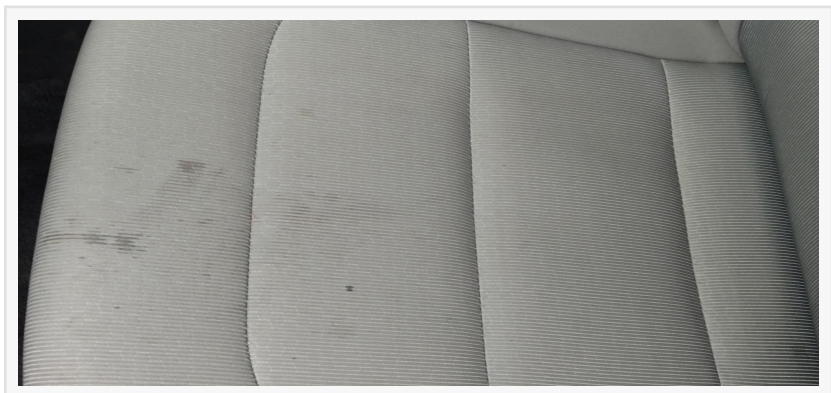
Renters easily implicated by $200 'stain' cleaning fee stamped to contract. Stain preexisting.

/EINPresswire.com/ -- <u>SubscriberWise</u>, the nation's largest issuing CRA for the communications industry and the leading protector of children victimized by identity fraud, announced today the presumably intentional destruction of video booth surveillance by Enterprise Holdings'