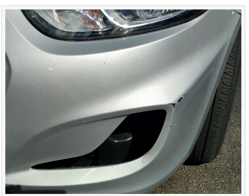
Preexisting damage; driving light missing means $$$ for renter