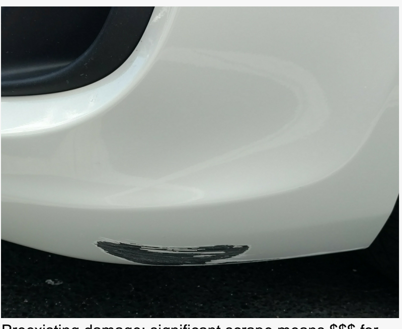
Preexisting damage; significant scrape means $$$ for renter

based on apparent video surveillance of her accessing a safe – but who was otherwise never offered the opportunity to view the footage that was used to implicate her (<u>https://www.inc.com/bill-murphy-jr/chipotle-fired-this-valued-employee-offered-her-1000-to-go-away-instead-she-sued-for-millions-and-won-heres-story.html</u>)