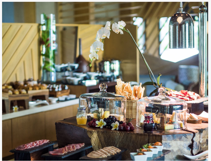
Delicious Buffet Lunch at the Club Lounge

Full Club Access is available at USD78 plus 21% government tax and service charge per person per day. To elevate your stay with The Ritz-Carlton Club experience, please contact our reservation team at rcbali.reservation@ritzcarlton.com or visit our website at