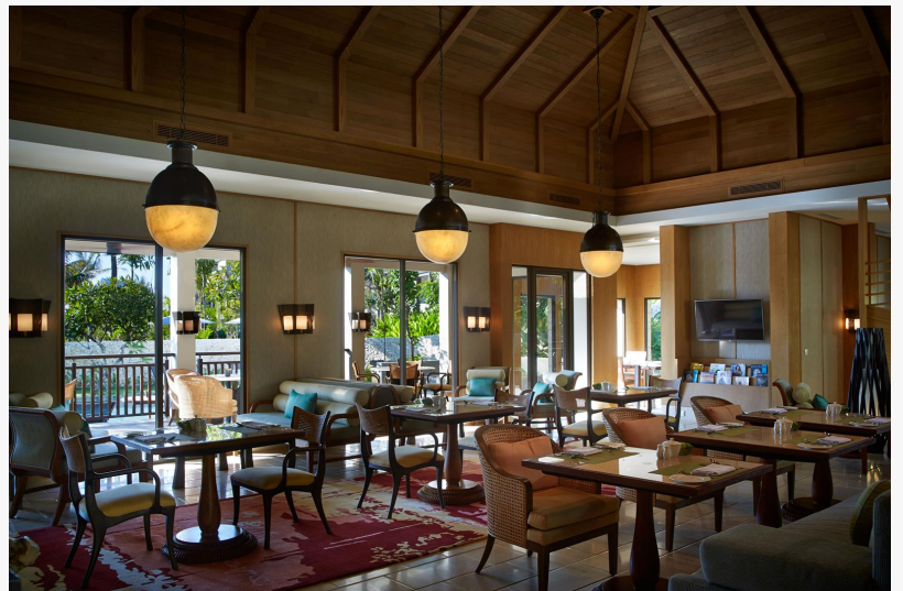
A cozy Club Lounge at The Ritz-Carlton, Bali