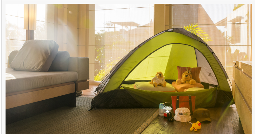
Ritz Kids Night Safari Tent set up in the villa

NUSA DUA, BALI, INDONESIA, May 22, 2018 /EINPresswire.com/ -- Happy kids means happy parents so why not indulge the kids with a holiday they will never forget and add the all-new Ritz Kids Night Safari experience to your list of fun activities at The Ritz-Carlton, Bali .