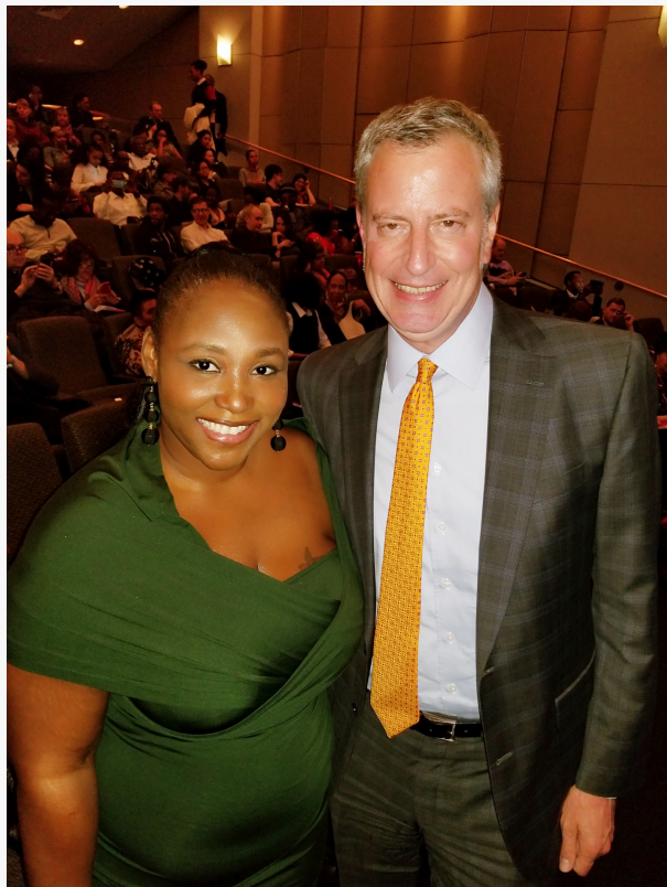
New York Mayor Bill de Blasio congratulates Director Apolline Traore on her award-winning feature film, "Frontieres" which opened the New York African Film Festival.