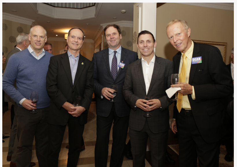
Patrick Brown, Peter Bethlenfalvy raising funds for Party

We took steps to ensure these nominations were run fairly and free from abuse. I personally ordered the party to bring in PWC to observe and certify our nominations. I have been as shocked as anyone else to hear about allegations that a candidate stole private 407 data. In retrospect, I am increasingly of the opinion political parties are ill equipped to handle nominations and that it is time to have Elections Ontario manage this part of our democratic process.