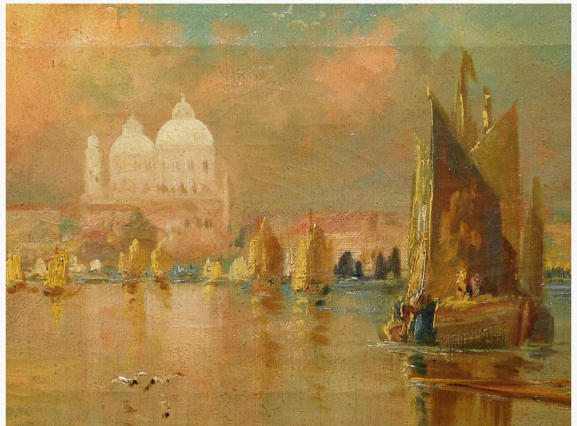
Oil on canvas painting attributed to Thomas Sidney Moran, titled Venice Canal (est. $30,000-$50,000).