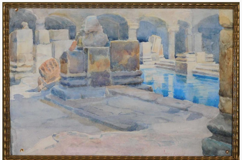
Watercolor painting attributed to John Singer Sargent, titled Classical Interior with Reflecting Pool (est. $30,000-$60,000).