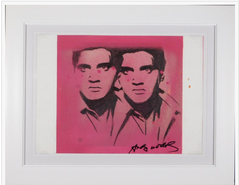
Mixed media on paper attributed to Andy Warhol, titled Double Elvis, signed front and back (est. $30,000-$50,000).

For more information about Woodshed Art Auctions and the Artworks from International Estates Auction planned for Thursday, June 7th, please visit www.woodshedartauctions.com .