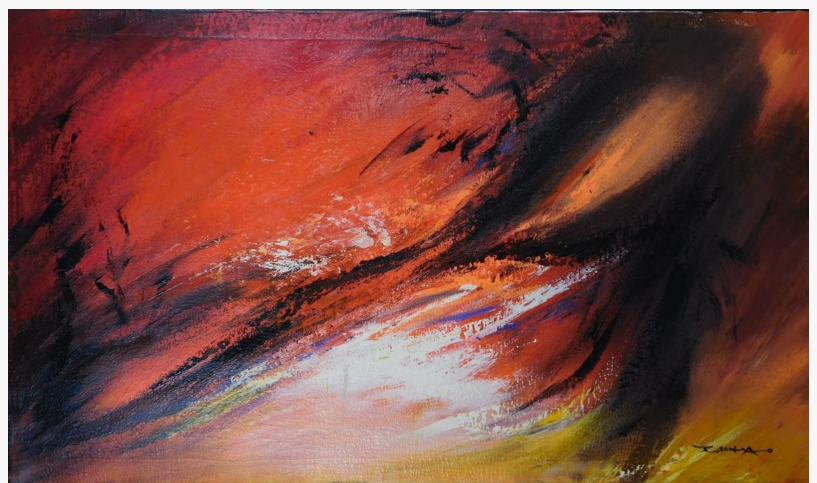
Untitled, unframed abstract oil on canvas painting attributed to Zao Wou-Ki (est. $100,000-$200,000)

An oil on canvas attributed to Charles Henry Alston (Am., 1907-1977), signed lower right and 21 ½ inches by 39 inches, has an estimate of $15,000-$20,000. Alston was an African-American painter, sculptor, illustrator, muralist and teacher who lived and worked in Harlem, in New York City. He was active in the Harlem Renaissance and substantially enriched Harlem's cultural life.