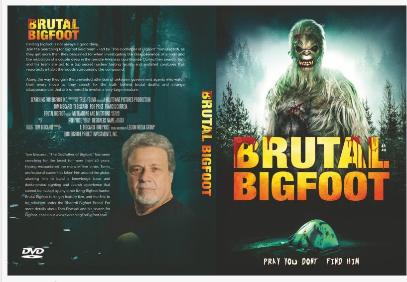
First of Five

In the first feature length film the Searching for Bigfoot field team – led by "The Godfather of Bigfoot" Tom Biscardi, get more than they bargained for when investigating the disappearance of a hiker and the mutilation of a couple deep in the remote Arkansas countryside in Brutal Bigfoot: Mutilations and Mutations. The film is the first release under the "Biscardi Bigfoot Brand" banner, a new label of True/Found, a releasing company dedicated to found footage and "caughton-camera" feature films and documentaries.