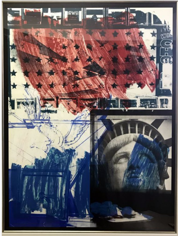
Lithograph and screenprint in colors by Robert Rauschenberg (Am., 1925-2008), titled People for the American Way ($24,600).