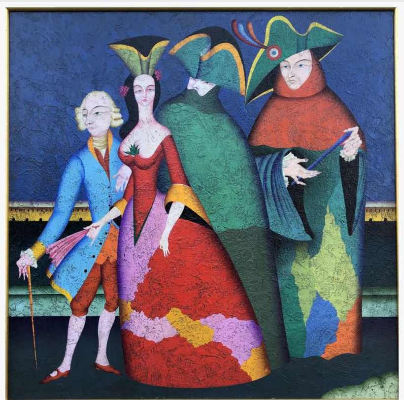
Oil on canvas painting by Mihail Chemiakin (Russian, b. 1943), signed and dated 1990 ($18,700).

A beautiful and monumental Royal Vienna hand-painted porcelain plaque depicting a religious scene, with an artist's signature in the