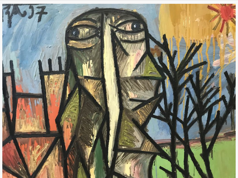
Large oil on Masonite painting by Francis Newton Souza (1924-2002), titled Head in a Landscape ($235,000).

LYNBROOK, N.Y., UNITED STATES, May 31, 2018 /EINPresswire.com/ -- LYNBROOK, N.Y. – A large oil on Masonite painting by the Indian-American artist Francis Newton Souza (1924-2002) climbed to $235,000, and three artworks by the Russian artist Mihail Chemiakin (b. 1943) – a painting and two sculptures – combined to bring $44,800 at an auction held May 17th by Weiss Auctions, online and in the firm's Lynbrook gallery at 74 Merrick Road.