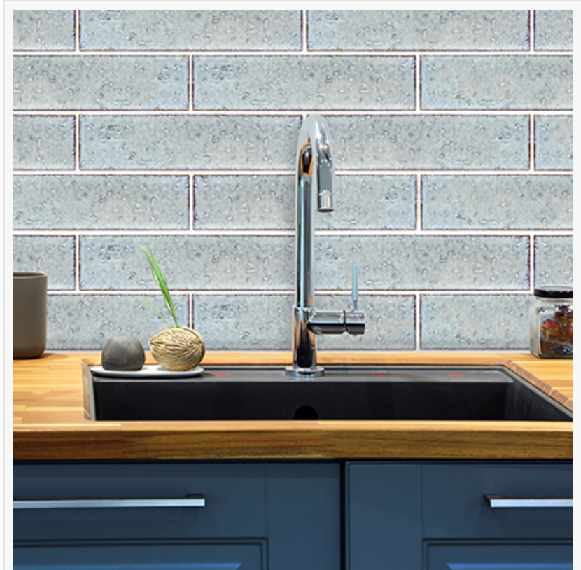
The Bricks! Collection is a refined rustic look. shown here is Frosted Grey.

Bricks! is an unusual shape measuring 9 ½" long by 2 ¼" wide, a new look and a new way for ceramic tiles to decorate space. District Bricks! has the appearance of old bricks, once painted, now aging gracefully; and Weathered Bricks! mimics wood panels left to nature to become more charming with time. As Susan Hager, Tango Tile's president, observed, "unlike naturally aged bricks and wood, Bricks! doesn't peel or fade or ever look less fabulous than the day it was installed. It is "weathered" to perfection and no more. As with all our artisan collections, it is the glaze that make the tile exceptional. The 13 colors are mottled and then given a slightly distressed finished to achieve a 'refined rustic' look.