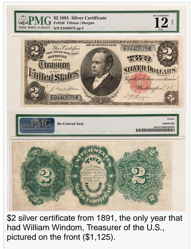
$2 silver certificate from 1891, the only year that had William Windom, Treasurer of the U.S., pictured on the front ($1,125).

This press release can be viewed online at: http://www.einpresswire.com