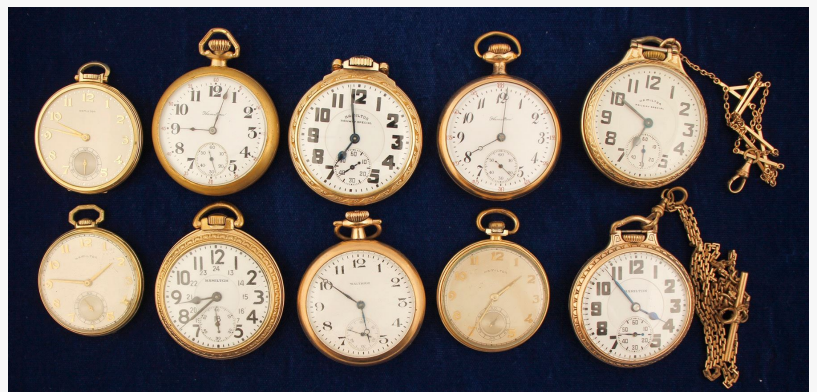
Group of ten vintage Hamilton pocket watches, all open face, some gold ($1,125).