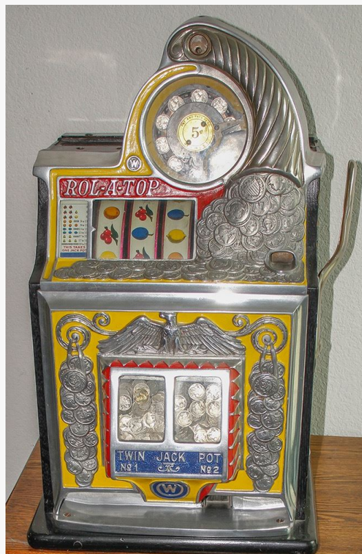
Mid-1930s Watling three-reel 5-cent slot machine, a Rol-a-Top model, a favorite among collectors ($3,250).