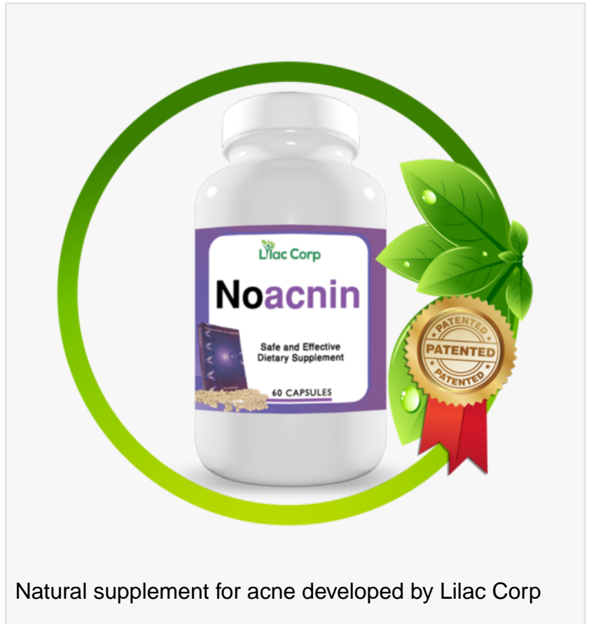
Natural supplement for acne developed by Lilac Corp

SARASOTA, FL, UNITED STATES, June 5, 2018 /EINPresswire.com/ -- A recent study tested the effect of essential oils on the bacteria that causes acne . The researchers took two kinds of bacteria that cause acne, S. epidermis and P. acnes , and grew them in a lab. Then, they tested the effect of 408 different combinations of essential oils on the bacteria. The results showed that Manuka oil in combination with other oils killed the acne bacteria. Ylang ylang oil was also effective. Other oils that were found to be antibacterial were sandalwood and patchouli. The combination of vetiver oil with cinnamon bark oil was the most effective. This study showed that combinations of essential oils may be beneficial in fighting the bacteria that cause acne.