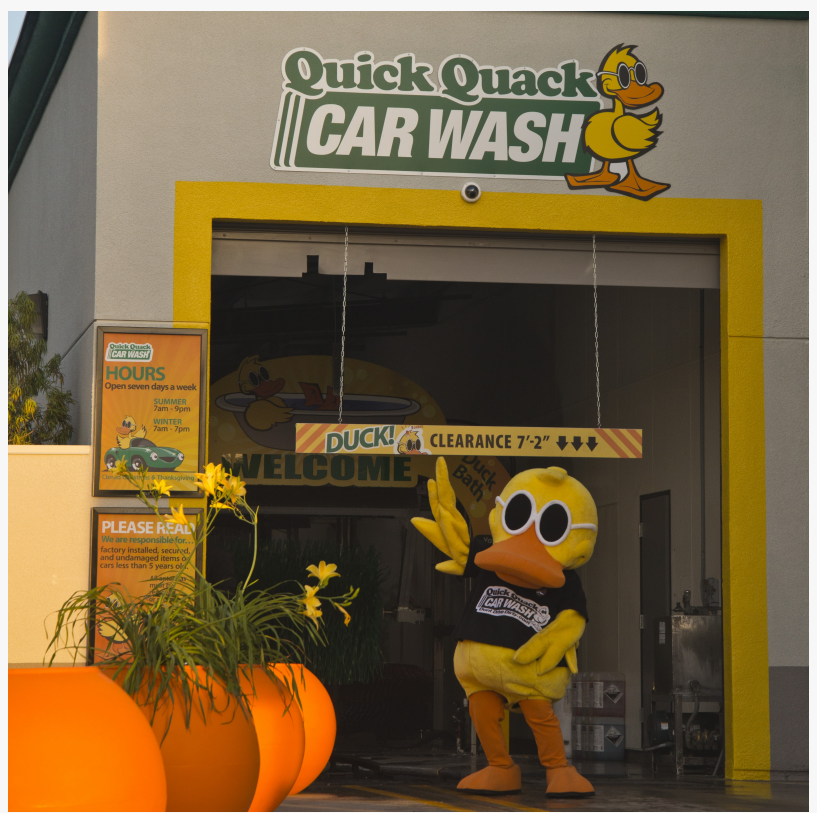
Quackals the Duck Mascot