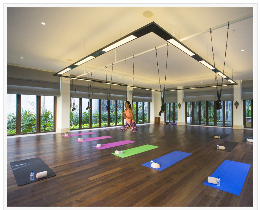
Yoga Studio at The Ritz-Carlton, Bali