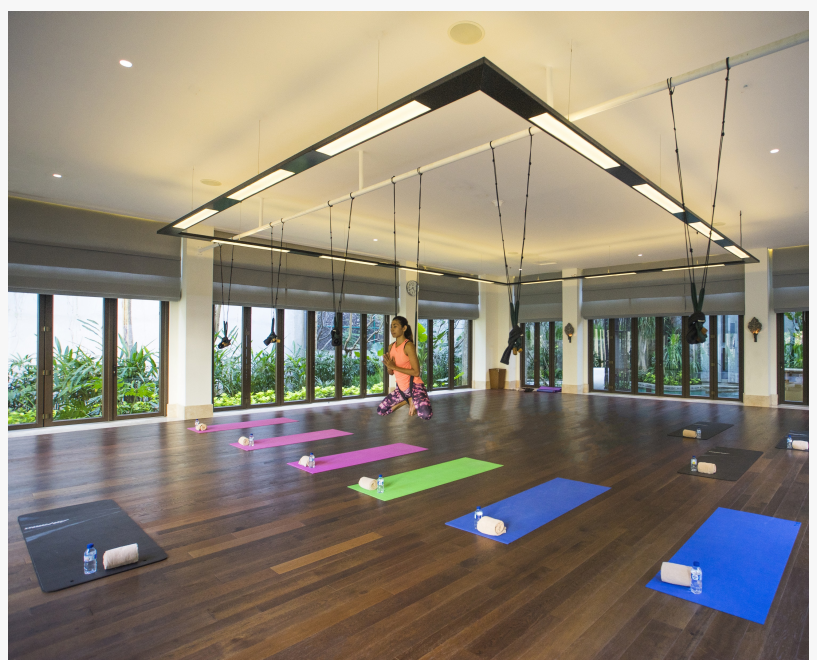
Yoga Studio at The Ritz-Carlton, Bali